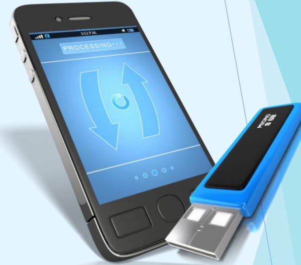
Protection of Mobile Devices / USB Devices